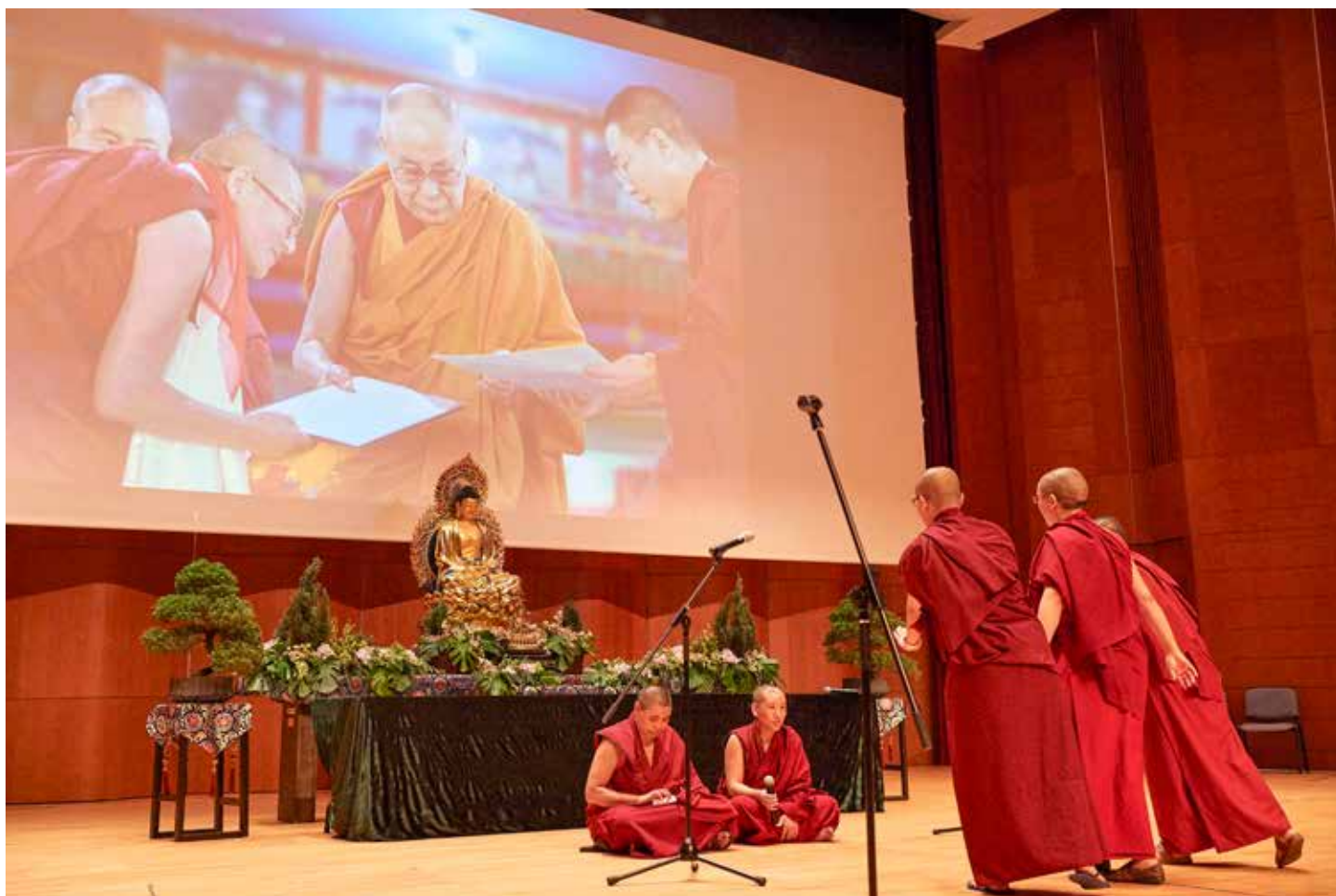
The nuns of Jamyang Chöling demonstrate the art of philosophical debate that leads to the geshe degree.

that day. Skillfully applying the tools of deeper and deeper analysis, they gain a more nuanced understanding of the topic, pushing the mind to its furthest reaches.