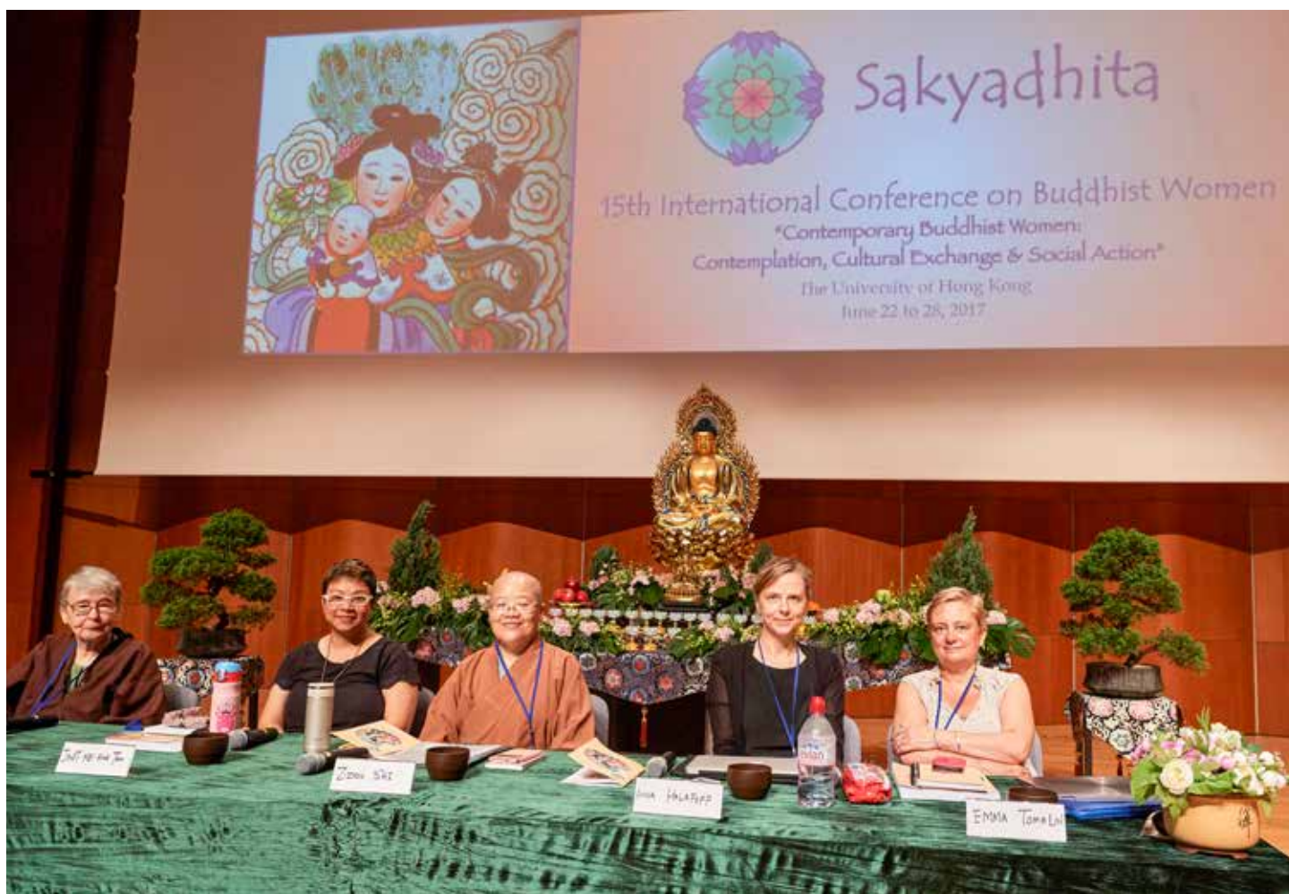
Panel presentations on Buddhism and Social Action

Attackers often start with an act of violence such as a punch to the face. The attack then escalates to rape, and sometimes ends in murder. The violence can often be extreme and a victim may even suffer broken bones before the rape, and endure further humiliation afterwards by acts of disrespect such as being urinated on, because the perpetrator views the victim as an object, a class of thing, rather than as an individual.