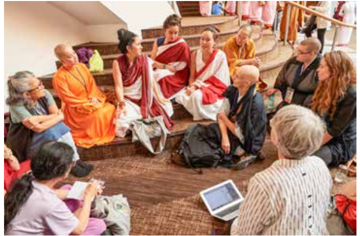
Buddhist women share ideas and experiences.

We are pleased to announce that the 16th Sakyadhita International Conference on Buddhist Women will be held in Australia! Details will be available on the Sakyadhita website. Members will also be informed by email, so please remember to renew your membership for 2017!